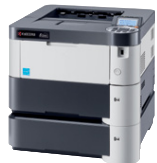
The images displayed in this brochure are for illustrative purposes only, and may include optional extras

Kyocera does not warrant that any specifications mentioned will be error-free. Specifications are subject to change without notice. Information is correct at time of going to press. All other brand and product names may be registered trademarks or trademarks of their respective holders and are hereby acknowledged.