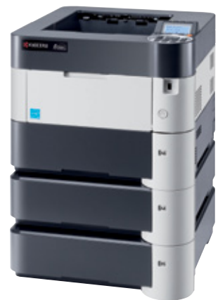
The images displayed in this brochure are for illustrative purposes only, and may include optional extras

Kyocera does not warrant that any specifications mentioned will be error-free. Specifications are subject to change without notice. Information is correct at time of going to press. All other brand and product names may be registered trademarks or trademarks of their respective holders and are hereby acknowledged.